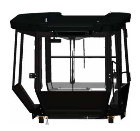
Asymmetric Cab features +